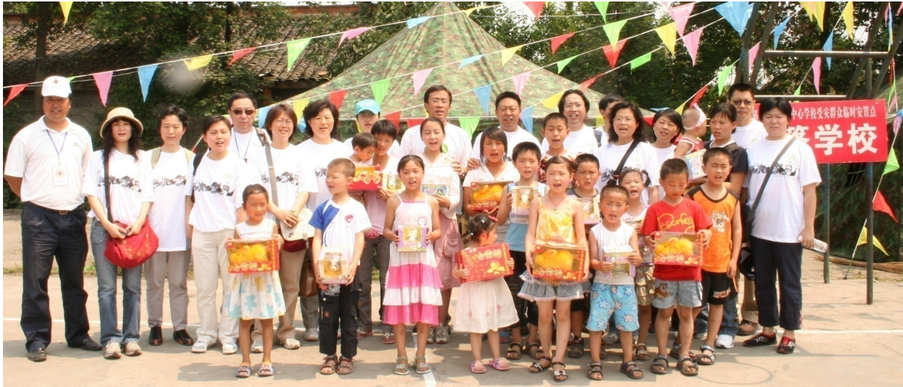
WEPAT members working with children at Tent School in Settlement Camps near epicentre in Sichuan